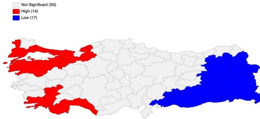
Figure 3: An example of LISA Map for the balance index for 2012

As Figure 3 shows, western cities have high-high clusters while there is a low-low cluster for the eastern cities in Turkey.